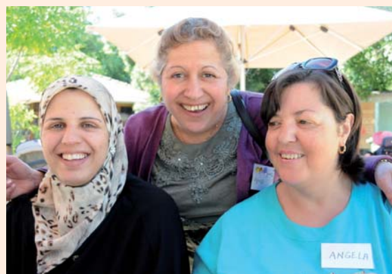
Enjoying a day at the zoo