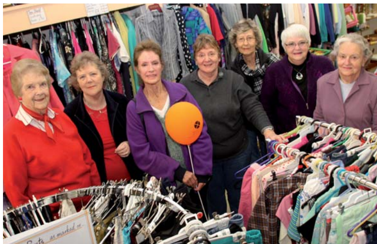
These Waverley Auxiliary ladies have contributed a combined 170 years of service.

As I chatted to one of the elderly people who come to our Coolibah Centre recently it became clear that one of the great pleasures in this lady's life was the friendship she has developed with one of the volunteers who help the Centre on a regular basis.