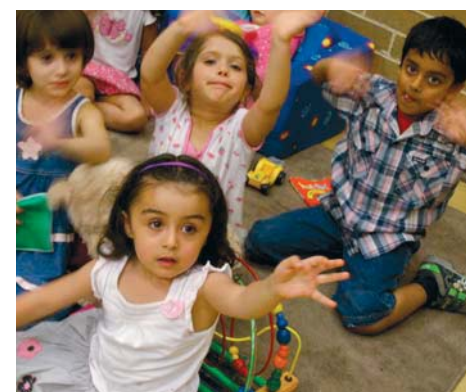
Cool Kids playgroup involves lots of fun activities.

"I was new to the country and had no friends or family – with the playgroup I make friends."