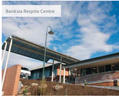
Banksia Respite Centre