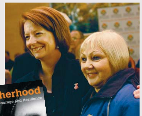
Julia Gillard at the recent launch of Brotherhood .

We encourage you to take time to read about some of their amazing journeys. And remember – your purchase of the book will enable us to continue our work towards an Australia free of poverty.